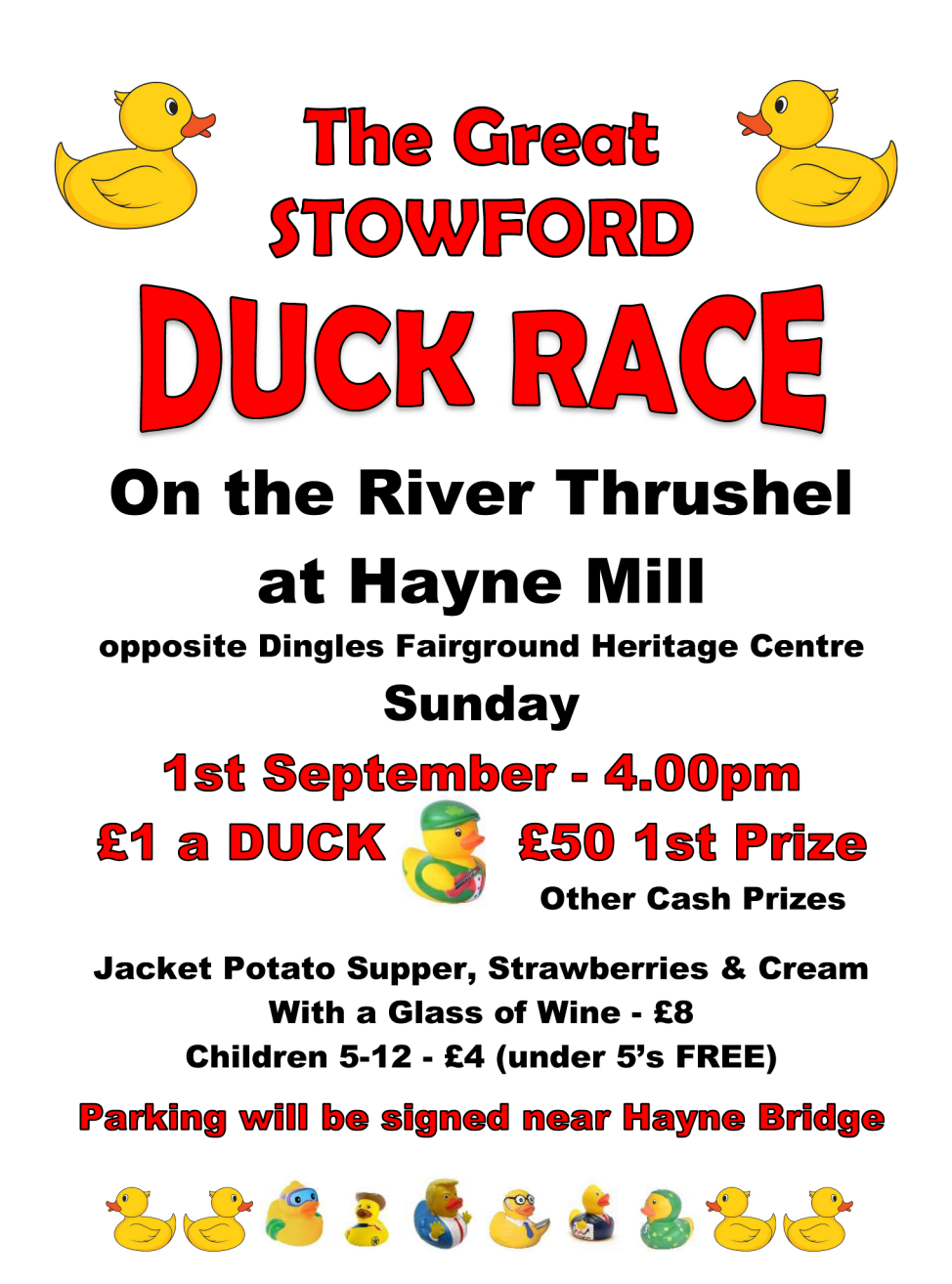
In aid of St. John the Baptist Stowford church funds