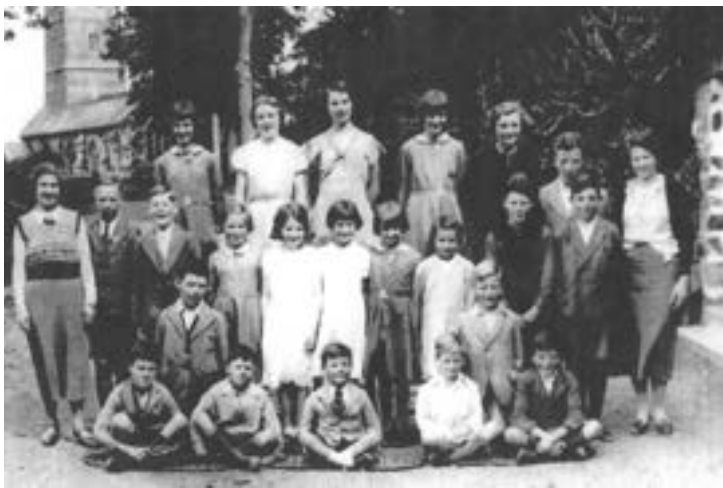
School Photograph 1938