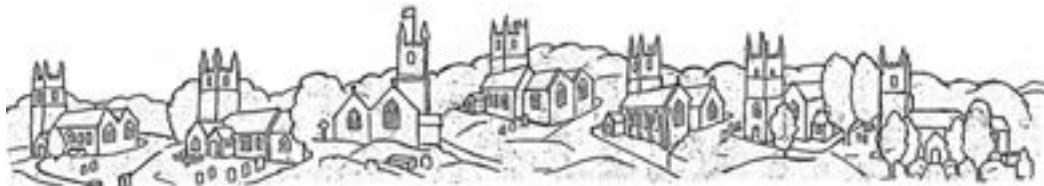
St. Mary the Virgin, Kelly with Bradstone