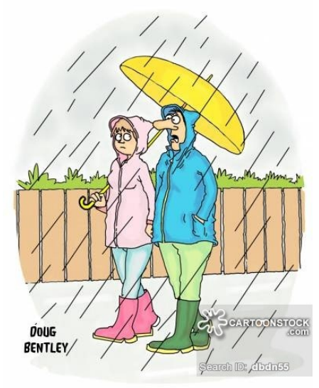
"I reckon Spring is just around the corner. The rain is definitely feeling warmer!"

I was in the pub the other day and got talking to someone. He said that he was just starting a zoo in the area but at the moment he only had one animal, a small dog. It's a Shizu.